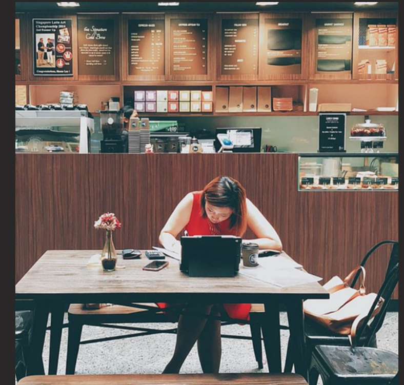
As a financial consultant