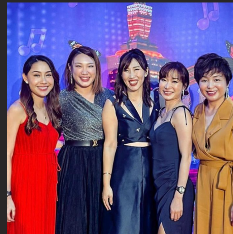
As an agency leader