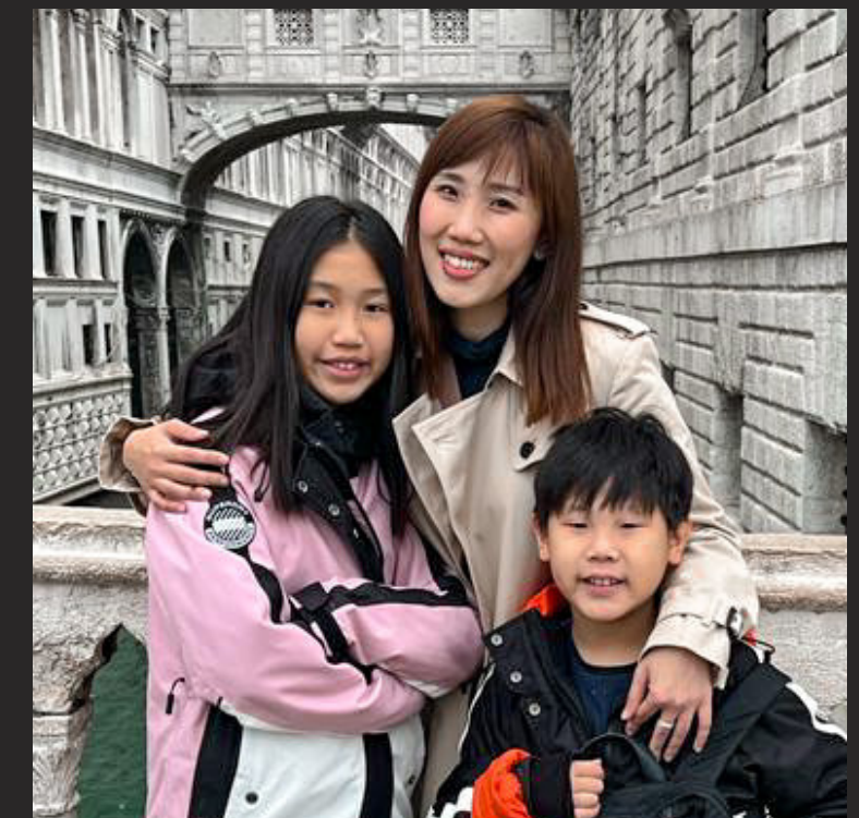
As a mother