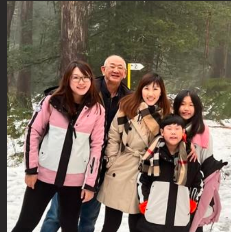
As a daughter & sister